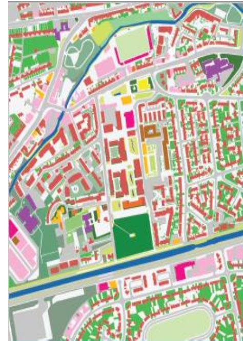
SITE PLAN FOR EMMET ROAD