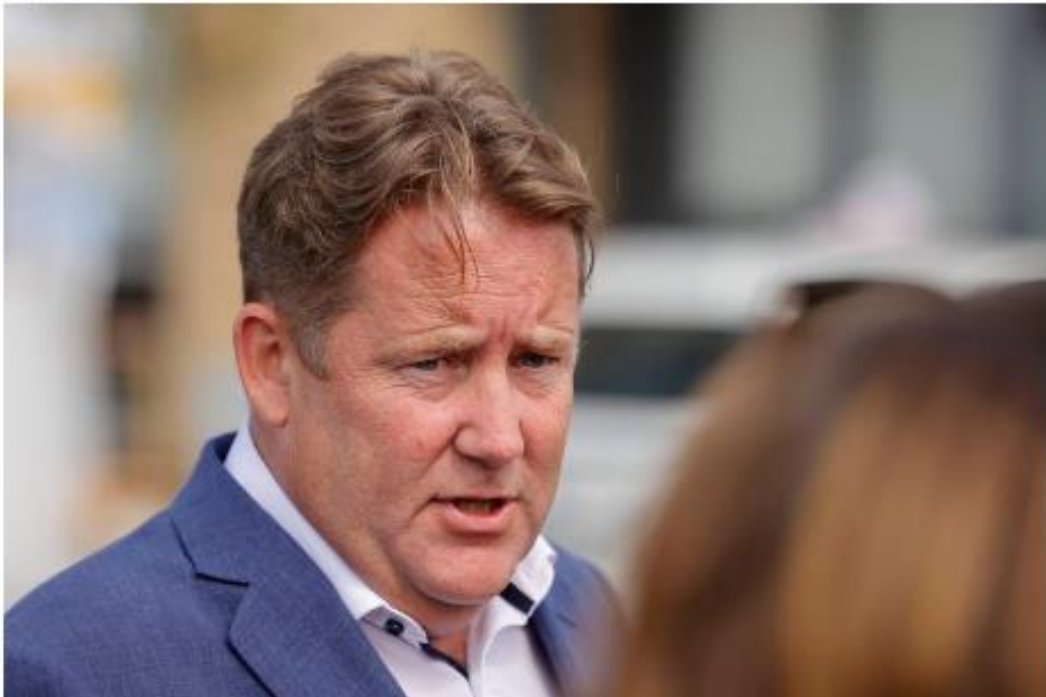
Minister for Housing Darragh O'Brien. Cost-rental is not-for-profit housing, whereby the rents charged reflect the cost of the construction, management, and maintenance only.