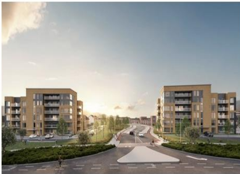
Tuath cost-rental housing scheme at Kilcorbery, Clondalkin: Fifty homes in Newbridge are being made available by lottery via property website Daft.ie.