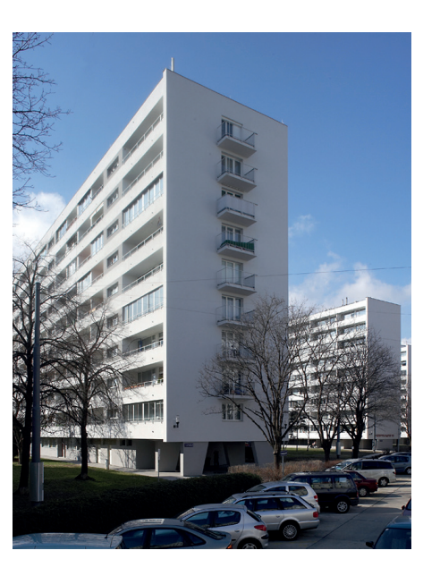
Karl-Wrba-Hof >

economy, social and cultural sciences, neither in Austria nor in Vienna. This deficiency is particularly puzzling when we bear in mind that social housing development takes on both a profound historical and also a current key position in Vienna and assumes a special model function in the city.